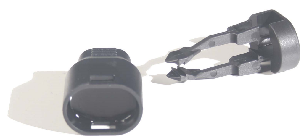
DOMOCLICK DHB-400 HEATING CABLE TERMINATION